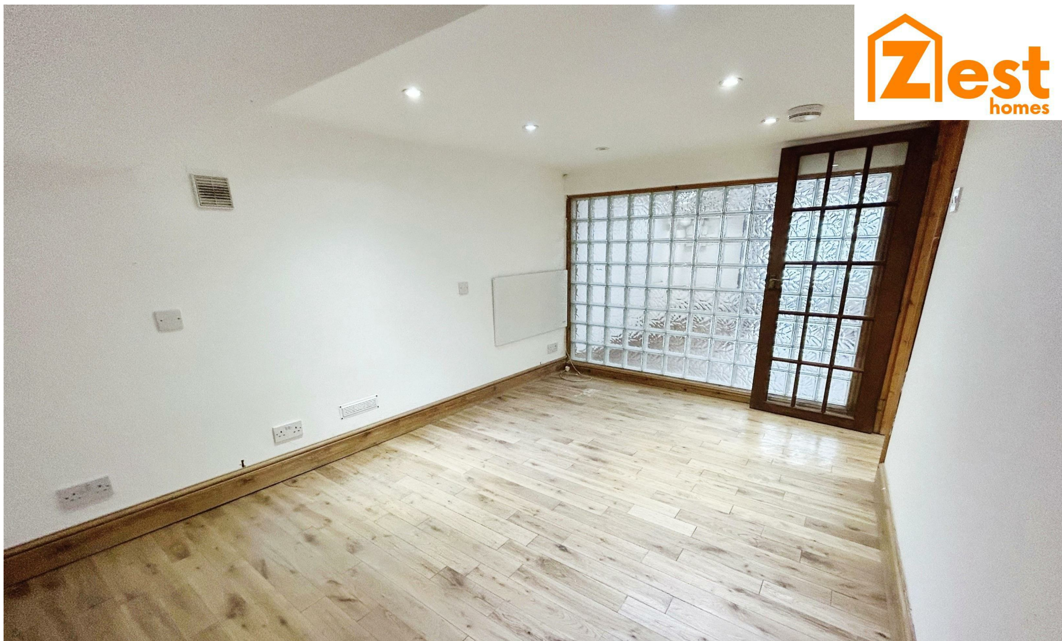
Rear Room, 34 Mortimer Street, Herne Bay, CT6 5PH £525 Per month